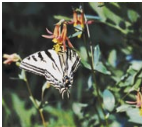
Pollination of native columbine

International Initiatives. NPCC worked with PlantaEuropa, a European native plant conservation organization, to secure the 2002 adoption of a Global Strategy for Plant Conservation by the Global Convention on Biological Diversity.