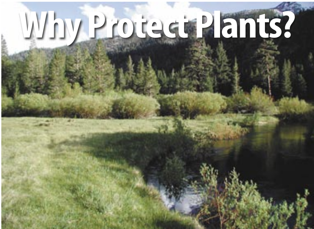
Eastern Sierra Nevada

Native plants are the most visible elements of our landscapes. Up and down our coasts, valleys, deserts, and mountains, thousands of wildflowers, trees, shrubs and other native plants perfume the air and delight the eye throughout the year.