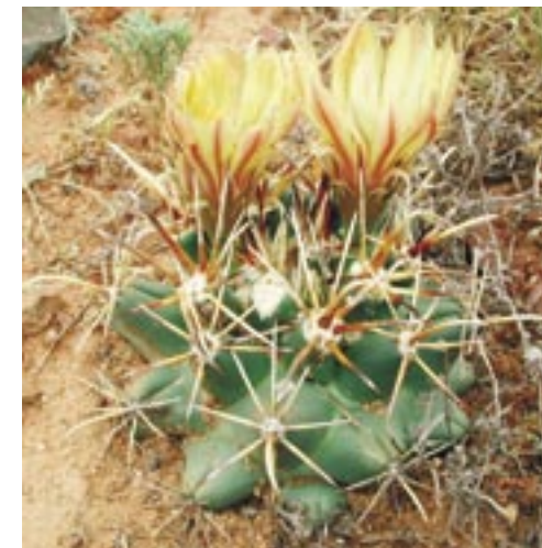
Coryphantha scheeri var. robustispina federally endangered

In budgeting, the situation is just as dire. Funding for rare species con-