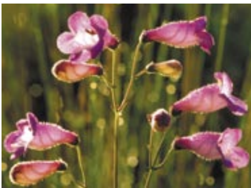
Penstemon dissectus, Georgia

Extinction of a single plant species may result in the disappearance of up to 30 other species of plants and wildlife – US Forest Service