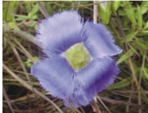
Fringed Gentian, Ohio

Initiative promotes broader awareness of the “second-class” status of native plants in staffing, funding and law. Our Equal Protection Statement has been signed by 62 groups representing hundreds of thousands of individuals, including the Society for Conservation Biology, the Botanical Society of America, the American Society of Plant Taxonomists, and Defenders of Wildlife.