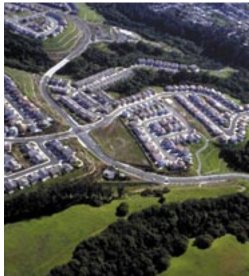
Urban sprawl into native oak woodland

The NPCC Network is a national network of affiliate native plant societies, botanic gardens, arboreta and other native plant science and conservation organizations. We exchange information and create a strong national voice for plants. As of January 2005, the NPCC has 33 affiliate organizations, representing more than 60,000 individual scientists and conservationists throughout the US.