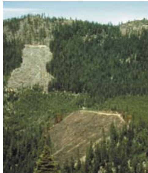
Clearcut Logging

The Endangered Species Act provides almost NO protection to most Federally listed endangered and threatened plants – among the most imperiled American species.